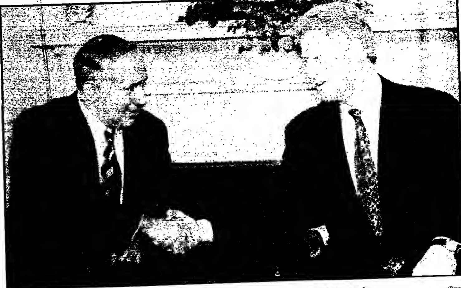
Prime Minister Binyamin Netanyahu meets with US President Bill Clinton in the Oval Office yesterday.

to Israel of F-15 fighters, as well as continued cooperative development of a theater missile-defense program and the Arrow missile, would "strengthen Israel's defense against attacks." Netanyahu responded by lauding Clinton's "unshakeable commitment to Israel's security" and said he left their meeting with a "renewed confidence" in Israel's ability to pursue peace. "The pursuit of peace and the practice of terror are incompatible. For negotiations to succeed, there must be a climate of stability and tranquility," Clinton said. Asked about the case of Hamas political leader Moussa Abu Marzook, currently detained in New York pending extradition to Israel, Clinton said the matter was not discussed in the meeting and that he "cannot discuss it until it's resolved in our courts." There were reports earlier that Israel was seeking to have Marzook be deported to Jordan so as not to test Hamas threats to carry out retaliatory acts of terror should he be extradited to Israel for trial. Clinton said he believes Netanyahu "has thought through a way" to maintain the momentum of the Hebron accord, consistent with Israel's security needs. "It's obvious he's been thinking very hard about this," Clinton said. "I was encouraged by that." The president called Tuesday's